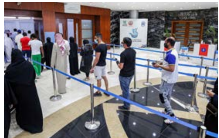
The NBTC HR & Administration Department organized an exclusive COVID-19 vaccination drive at Kabd Vaccination Centre, for its employees and their family.