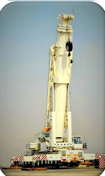
555 Ton Capacity Crane

NBTC has one of the highest capacity cranes in KUWAIT